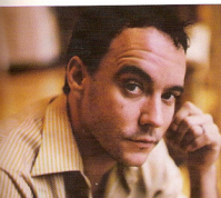
• dave matthews

Considering those statistics – and the innumerable milestone concerts in between – it's somewhat surprising that it's been four years since the last official DMB concert recording, 1999's Listener Supported . That set, issued both on CD and DVD, harnessed a show specifically performed for PBS's In the Spotlight program, but was not as highly praised