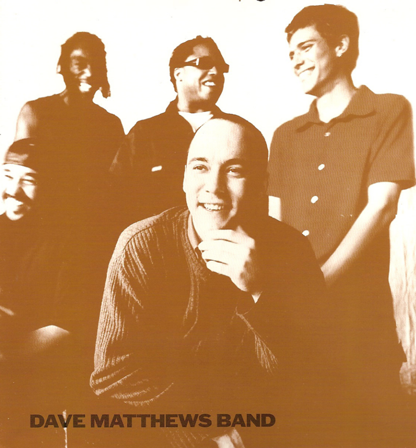
DAVE MATTHEWS BAND